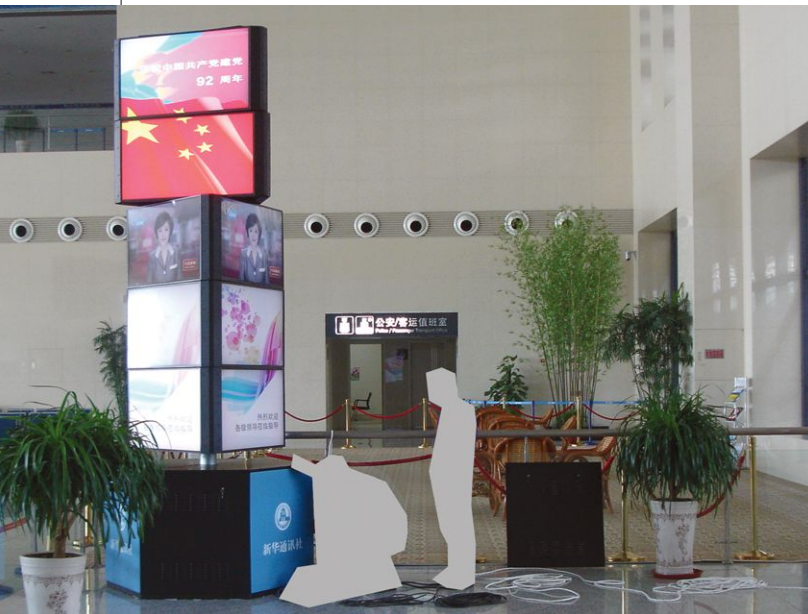
LCD advertising display tower. It is playing advertising contents customized by Xinhua News Agency.

the driver, which prevented the CPU from being overloaded when playing video.