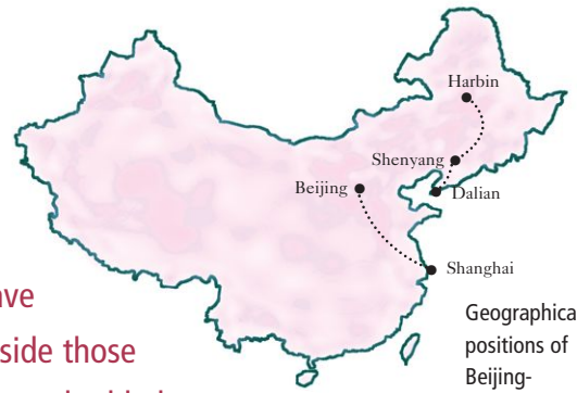
Geographical positions of Beijing-Shanghai and Harbin-Dalian high-speed lines on China's mainland.

Since 2000, electronic displays such as LCD and LED have been widely used in advertising all over the world. Inside those advertising devices, open-source software compiled for embedded systems supports playing audio and video, accessing an SD card or USB flash drive, and networking and remote control.