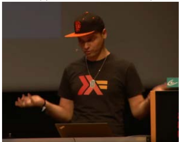
Tell us a little about yourself.

Welcome to the first 2018 edition of the Faces of FreeBSD series. Here's a chance to get to know your fellow FreeBSD enthusiasts. Sit back and enjoy the next Faces of FreeBSD story.