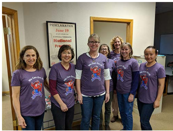
We decided to have everyone install FreeBSD on VirtualBox to allow us to speed through the installation process, and cover more material.

We also designed a fun t-shirt for this inaugural event, as you can see below.